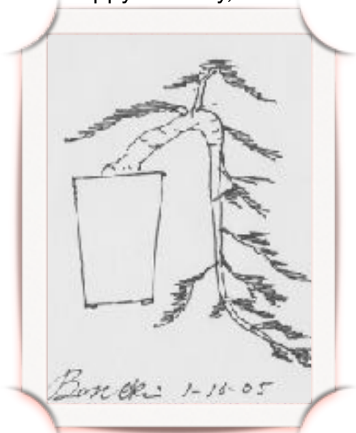
Juniperus Procumbens nana