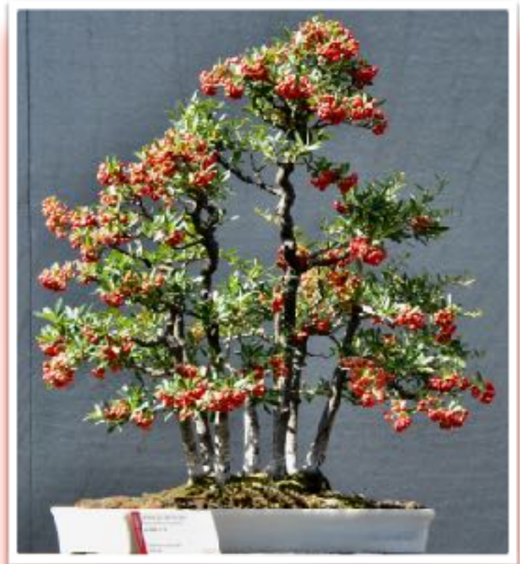
Pyracantha Firethorn - NBF