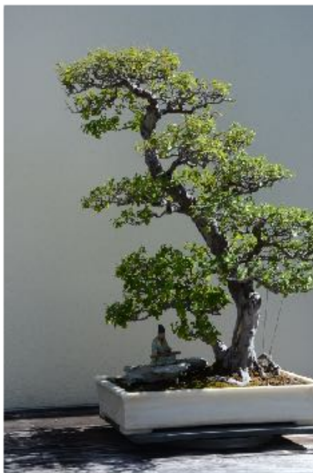
Pauper's-Tea/Sageretia Thea Chinese Collection, NBF

It will soon be time to begin pinching new growth on deciduous trees and to begin trimming junipers and pines. Pine candles should be cut in late March to force new, shorter candles in April.