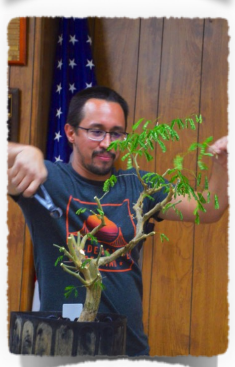
and the trees will dance

Far across hill and dale The blossoms of the plum have cast A delicate pink veil. Kiho