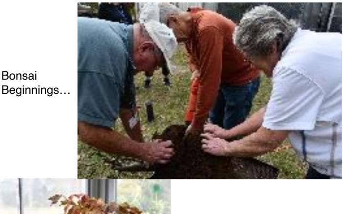
2 different maples in winter leaf

May 22-24 - Brussel's Rendezvous, Olive Branch MS