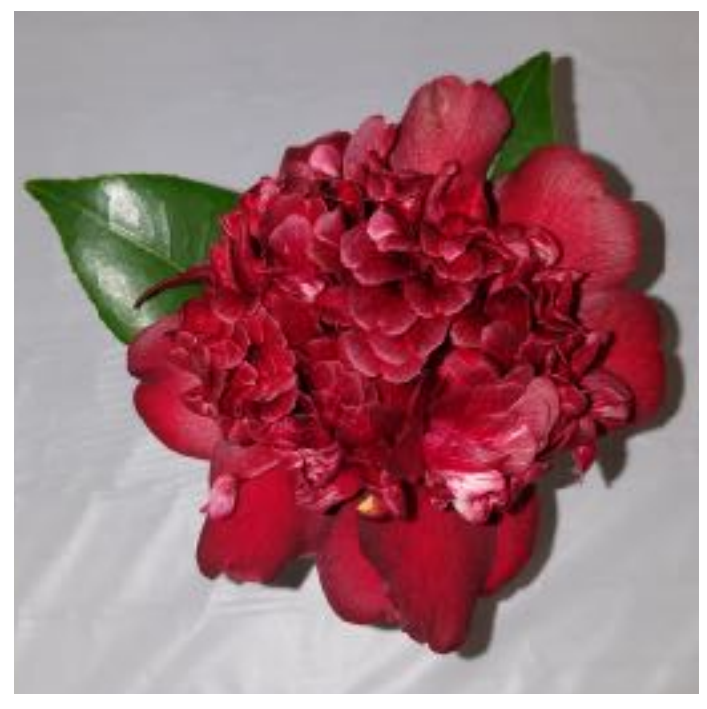
'Sawada's Mahogany' camellia