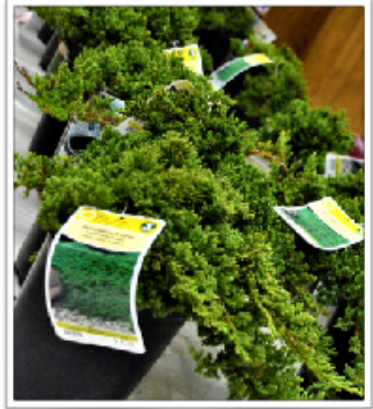
Lots to work on!!