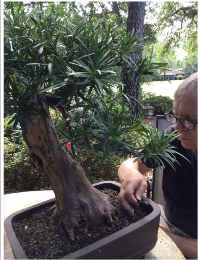
The 'one branch' bonsai

Get ready for the show! Lots of work to be done.