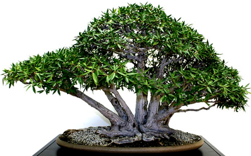
National Bonsai and Penjing Museum